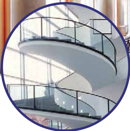
Neues Museum in Nuremberg

Bavarian universities offer students high educational standards and a wide range of academic choices. Bavaria is regarded as one of the scientific and technological centres of Europe boasting first-class research institutes, universities and colleges. In addition, it offers a high quality of life. Studying in Bavaria is a good choice!