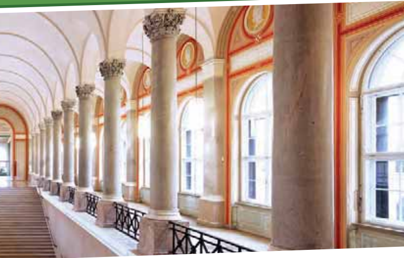
Bavarian State Library in Munich

With its majestic mountains, rolling hills and numerous lakes, nature provides great places for a variety of sport and leisure activities such as cycling and skiing, hiking and mountaineering, or swimming and sailing.