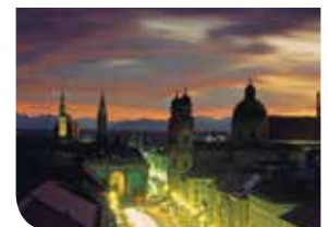
MUNICH Big city flair – just a 30-minute train ride away