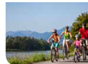
INN VALLEY Riding the bike to university and in the beautiful Inn valley