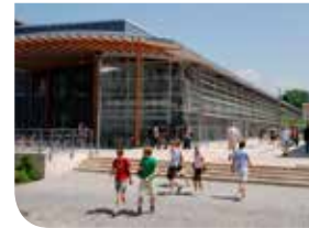
ROSENHEIM Modern campus at TH Rosenheim