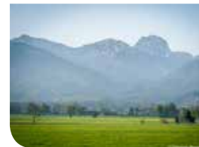
WENDELSTEIN Stunning mountains with an impressive view