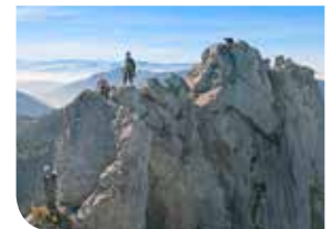
KAMPENWAND 1,669 m high, triple-peaked rock formations