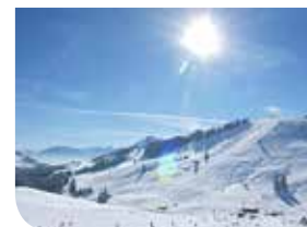
SUDELFELD SKI RESORT From your lecture to the slopes in only 30 minutes