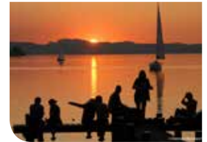
LAKE CHIEMSEE Beautiful sunsets, swimming, sailing, windsurfing