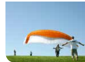
HOCHRIES Paragliding, mountain biking, hiking and much more